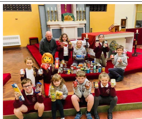
Harvest Mass on Wednesday was a wonderful celebration - thank you for your kind and generous donations of food

*Please book 48 hours in advance to allow staff planning or we cannot guarantee availability.