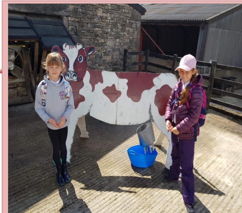
KS2 Trip to Heaves Farm