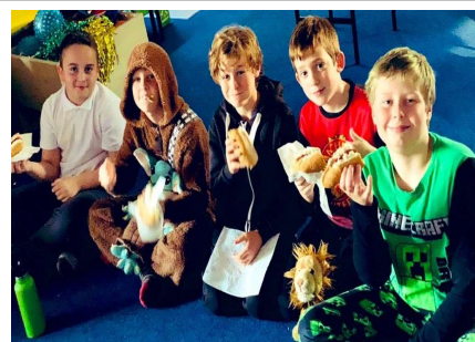
The PFA Movie Night was a great success

*Please book 48 hours in advance to allow staff planning or we cannot guarantee availability.