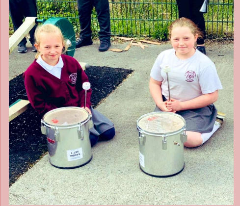
KS2 enjoying outdoor music this week

*Please book a week in advance to allow staff planning. If less notice is given we cannot guarantee availability.