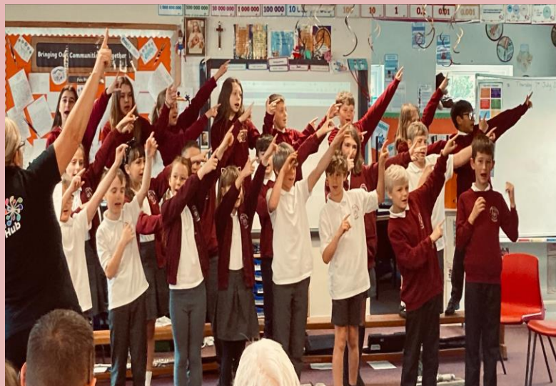
Our KS2 performance on Thursday