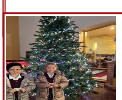
The children did a great job decorating the church Christmas Tree