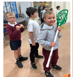
The whole school enjoyed a Lacrosse session on Thursday

You are welcome to join us for either performances. Unlike other schools, we do not charge for these events but we will have a collection bucket to help us cover license fees etc. Any additional money collected will be used for class resources.