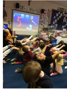
EYFS & KS1 enjoying Number Yoga