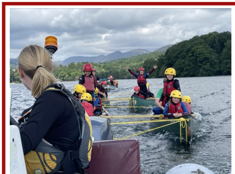
KS2 enjoyed another fantastic Watersport Session with Windermere Outdoor Activity Centre