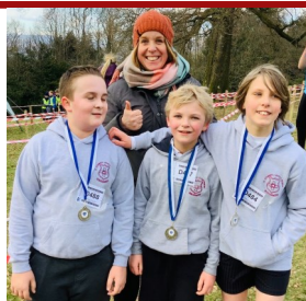
Look at their medals!!