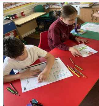
KS2 have been continuing their learning on Plants