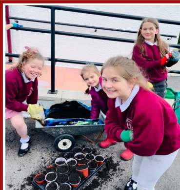
Gardening Club planting salad items and Garlic Chives