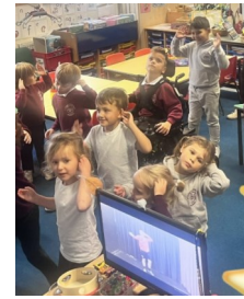
The Explorers enjoying 'wake up shake up'

It is unbelievable how quickly this academic year is already going by! Already we are mid-way through the Autumn term! Children have started new topics this week and have been enjoying sharing tales from their half term breaks.