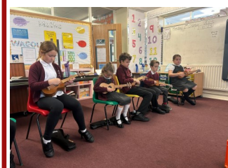
Learning to play Ukuleles with Cumbria Music Hub