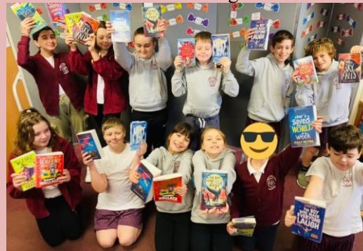
We are in the Gazette!!